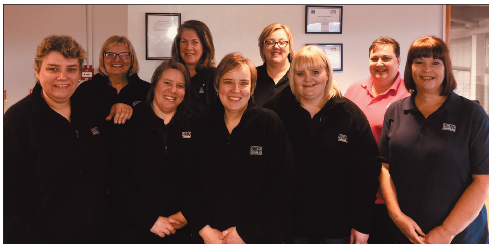
↑ Just some of the women behind Rope Assemblies